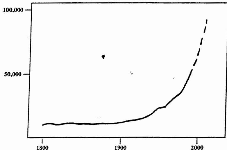
Figure 1. Human population in American Samoa

Several of American Samoa's government agencies have developed regulations, guidelines and educational activities aimed at reducing these impacts. De-